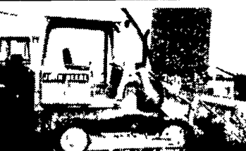
95 JD 455G, 2200 Hrs., Extra Clean.....$31,500

(2) 312 Hydraulic Excavators Your Choice $36,000 95 JD 310D, Tractor Loader Backhoe, Cab, 4x4 ..... $26,500