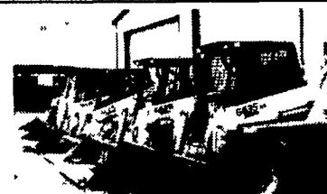
(2) '97 6635 Gehl Skid Loader, 800 Hrs.....$15,500 & 1100 Hrs., 14" Rubber & Ex. Large Bucket.....$16,500 98 5635 w/300 Hrs.....$14,500 97 Gehl 4625, 600 Hrs.....$12,500 Gehl 5625.....$6,900