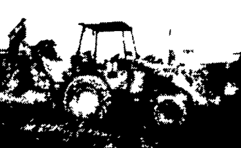
Case 480C Tractor Loader Backhoe.....$6,900

JLG 40' Scissor Lift, 4 Cylinder Ford ..... $7,500