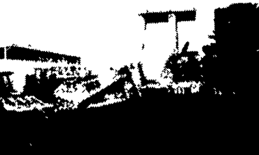
'86 Cat 953 60% UC $37,000