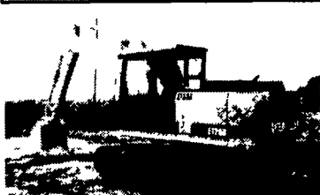
Cat E120 Hydraulic Ex. 1989 New Paint, Nice.....$26,500