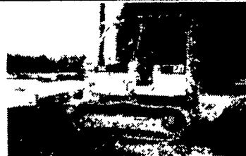
96 Cat D4C w/Ripper, 2300 Hrs.....$48,000 $46,000