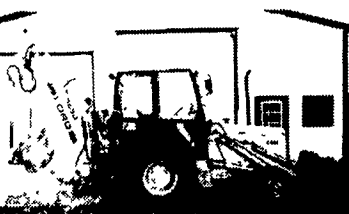
96 Ford 555D 4x4, Ext. Hoe, Cab, 2350 Hrs.....$27,500

Grove 66 Ft. 4x4 Manlift..... $12,500 Grove 45 Ft. 2x4 with 1700 Hrs..... $12,000 Simon 66 4x4 Manlift..... $13,000