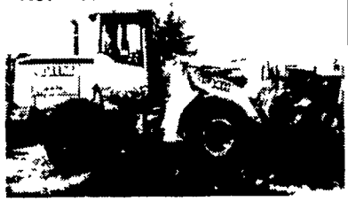
'98 JD 544H 1610 Hrs., J.R.B Coupler $80,000

Road Service Available Now Custom Repairs On All Construction Equipment