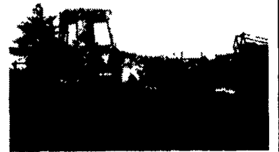
'81 Cat 963 Rebuilt Motor, New U/C, New Paint $40,000

All Machines Listed For Sale Are Also For Rent