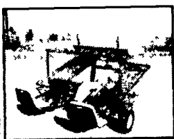
MODEL P150 WATER WHEEL PLANTER