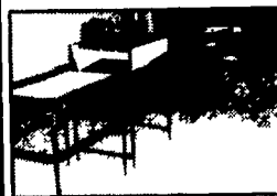
PACKAGING MACHINERY Model 2550 & 2600 RAISED BED PLASTIC LAYERS