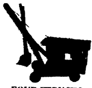
FOUR TRUCTO STEAM SHOVEL