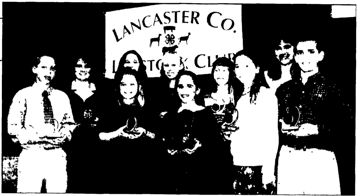
Swine Club record book winners at the 4-H banquet.