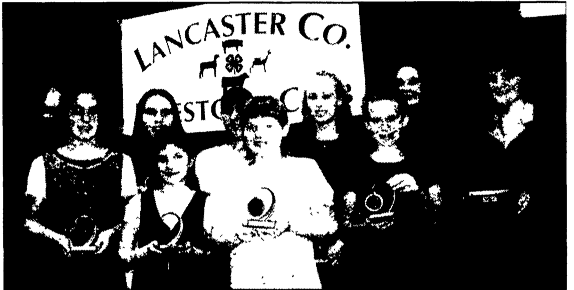
Woolies record book winners at the banquet.