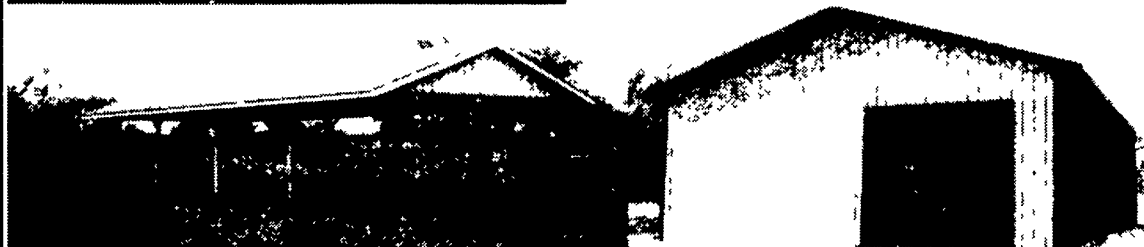
* Pole shelter shown