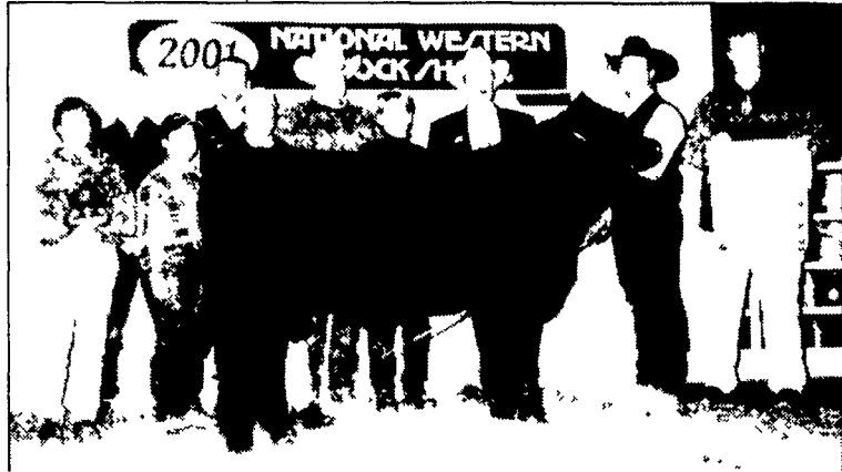
EGL Guido K051 ET, grand champion bull of the National Gelbvieh Show on Jan. 8, is owned by Eagle Pass Ranch, Highmore, SD.