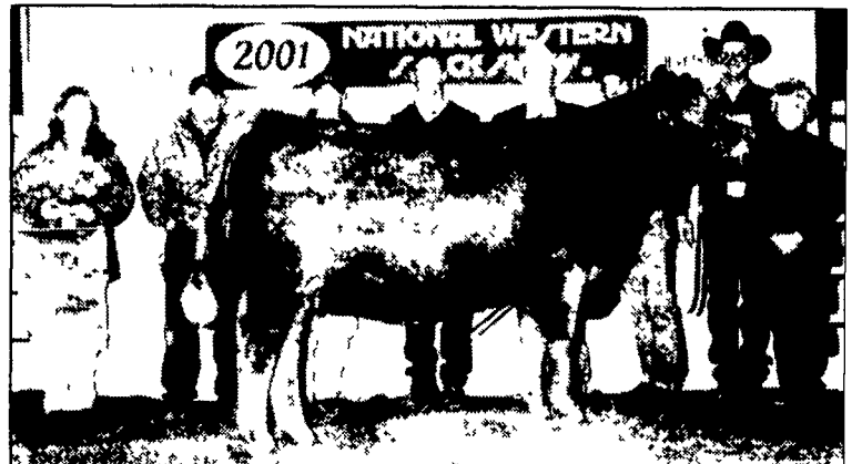
Grand Champion Female of the 2001 National Gelbvieh Show in Denver, Colo., was JRI Ms. Pld Frontier 253J60. Owned by Judd Ranch, Inc., Pomona, Kan., she sold at the National Gelbvieh Sale for $19,000. Judd Ranch won the premiere exhibitor honor at the show.