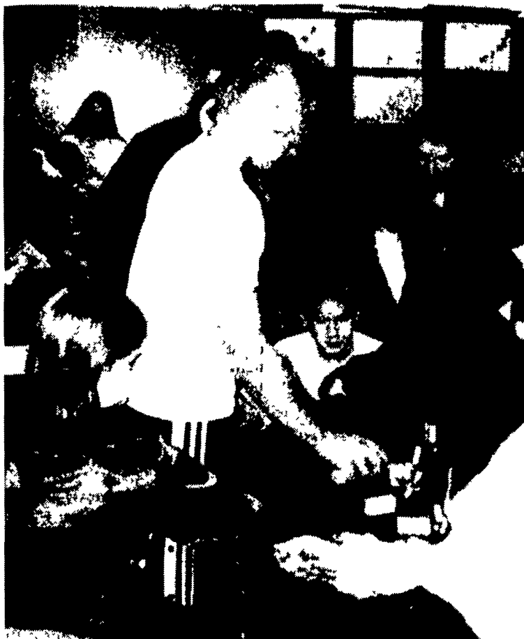
On an FFA chapter visit, students participate in the building block activity.