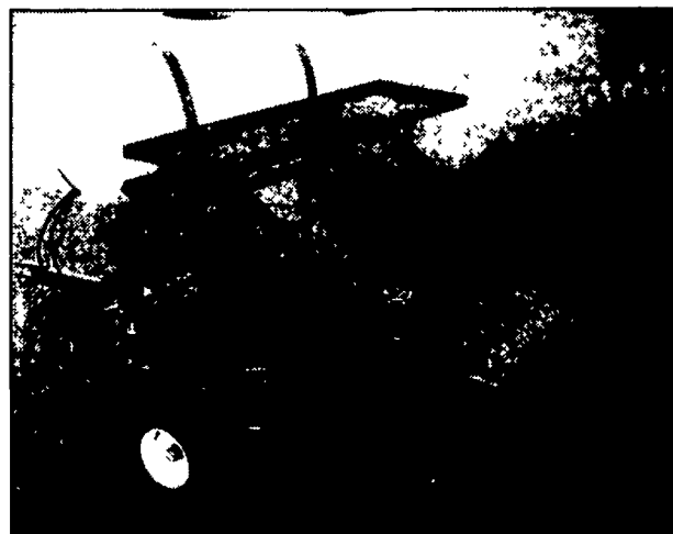
The most versatile water wheel transplanter for planting vegetables into plastic mulch.