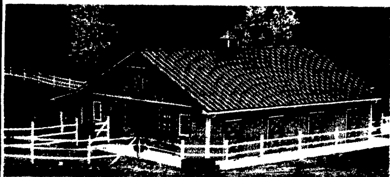
Complete Building Packages, Trusses And Glue-Laminated Timbers