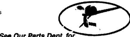
24 Ft. Propeller

See Our Parts Dept. for Vacuum Pump Parts & Repair Service!