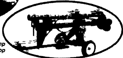
H6000 Pit Pump With Hydraulic Prop