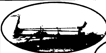
PL290 Lagoon Pump 40 Ft. Length

Let Us Help You Design Your Needs! Call Binkley & Hurst Today.