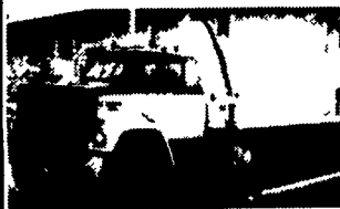
VACUUM OR GRAVITY