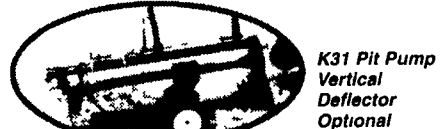
K31 Pit Pump Vertical Deflector Optional