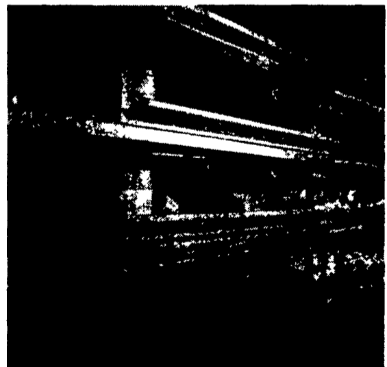
Walk the building and prove it to yourself... constant temperature top to bottom, side to side. Air to bird cooling. It's tomorrow's system and it's available today.