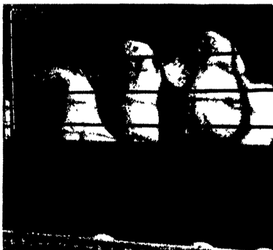
Odor problems are all but eliminated with this layer cage system. If your operation is in an area where odor is a problem, you need to check out the Stak-Aire System.