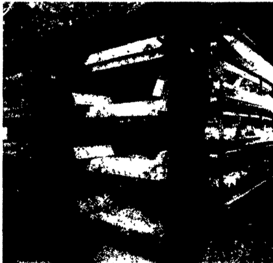
Flies? If you don't have flies, you don't have to spend money controlling them. Check out this Advantage. It's one of many.