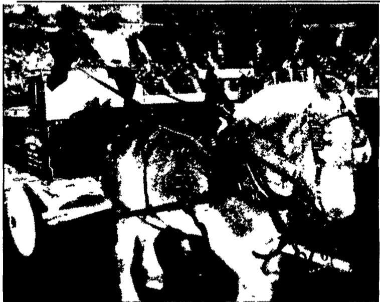
These Belgians competed in the draft horse hitch class on Sunday evening.

The Draft Horse Queen competition involves writing a resume and essay explaining what each contestant would do as queen. The writings are then evaluated by a panel of judges from the board of directors of the Pennsylvania Draft Horse and Mule Association.