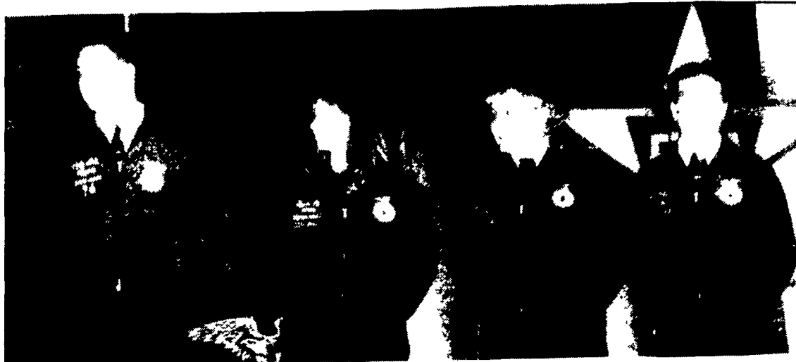
New Oxford FFA members presented $25,000 toward the state FFA "A Brighter Future" campaign Monday evening.

• The following were recommended for the state award and the national award: West Snyder, Twin Valley, James Buchanan/Conococheague, Middleburg, Manheim, Cumberland Valley, Manor, Coudersport/Spud Growers, Cloister, Dover, Greenwood, Brothersvalley, Selinsgrove, and Hans Herr.