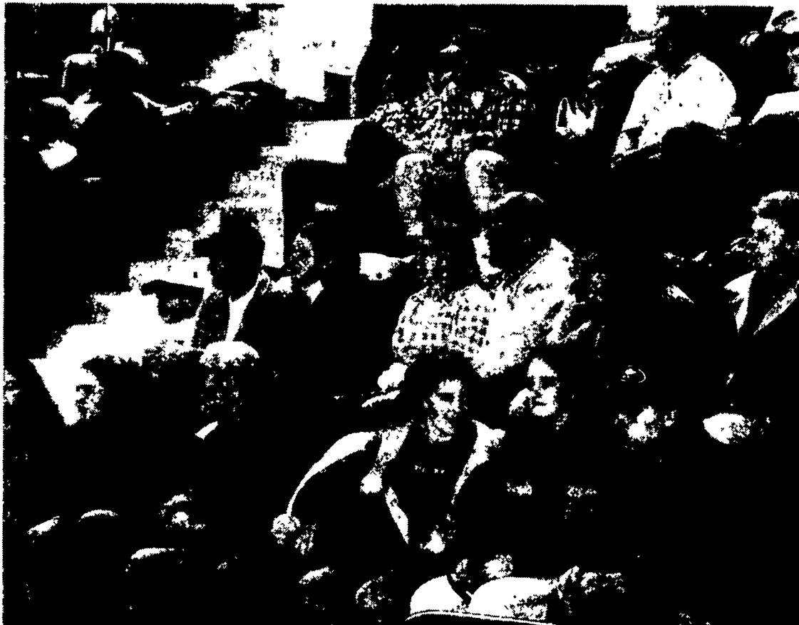
Watching the crowd watching.