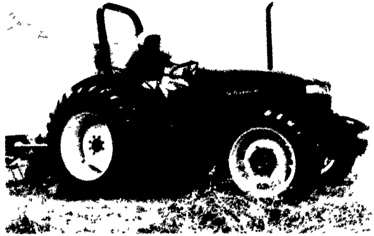
Customer driven design

TND/TNS tractors have the features customers say they need. These tractors outperform and outmaneuver all others in the three-cylinder class. Plus they're loaded with comfort and convenience usually found on much bigger tractors.