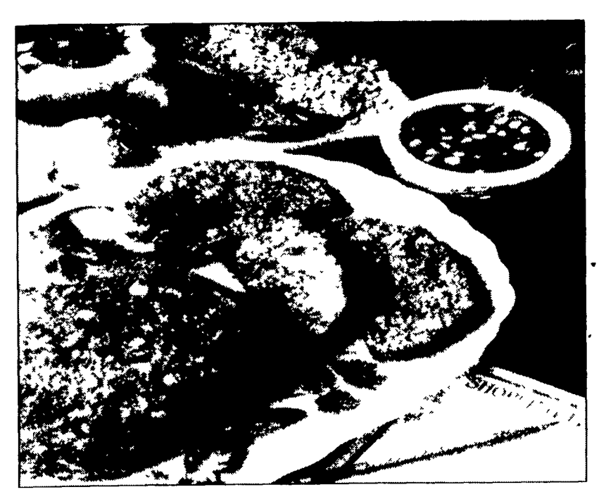
Pair slices of leftover meatloaf with on-hand ingredients to create delicious sandwiches.