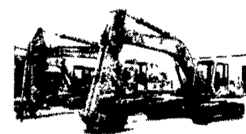
Hitachi EX200-3, Low Hours $46,000 90 Cat EL200B, $29,000 Good Condition