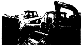
91 Bobcat 943 Skid Loader, Grapple Bucket, Tracks, Foam Filled Tires. $11,500 94 Bobcat 953 ..... $12,500 773 Bobcat, Good. ..... $11,500