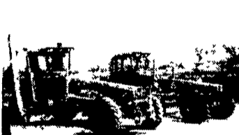
JD 670 Graders, 12' Blade 1 w/Snow Wing $19,000 & $25,000

96 Case 580 Super L Backhoe, 4x4, Cab, Ext. Hoe..... $29,500