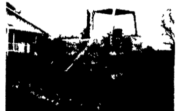
JD 750B Dozer, Straight Blade w/Tilt, Rebuilt Hydros..... $27,500