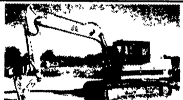
Cat E120B & 110B Excavators, % 4 To Choose From $22,500 to $24,500