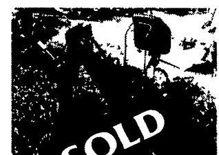
1998 KUBOTA 4520 BACKHOE PTO Pump, 3 Pt. Mounts Available

6' Sicklebar Mower Gandy Drop Spreader Bobcat 990 Backhoe Kubota 5' Boxscraper 6' Harley Power Rake