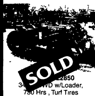
2850 34" 4WD w/Loader, 750 Hrs., Turf Tires