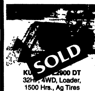
KUBOTA 2900 DT 32HP, 4WD, Loader, 1500 Hrs., Ag Tires

Cub Cadet 1641, 16HP, Twin Cyl., 300 Hrs., Very Clean Wheel Horse C-105 10HP, 37" Cut Cub Cadet 1863 48" Mower Kubota FZ2400, 60" Deck, Low Hrs. Cub Cadet 1210 Simplicity 6512 42" Cut Bagger Kubota G4200 Garden Tractor 44" Mower Diesel w/Blade Honda 4814 18 HP Liquid Cooled 48" Mower Hydro.