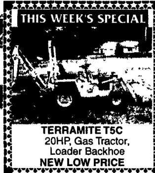
TERRAMITE T5C 20HP, Gas Tractor, Loader Backhoe NEW LOW PRICE