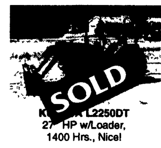
KUBOTA L2250DT 27 HP w/Loader, 1400 Hrs., Nice!