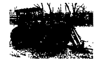
KUBOTA M6950DT 66 HP 4WD w/Loader and Bale Spear - Nice

Mon.-Fri. 7:30 AM to 5:00 PM Sat. 7:30 to Noon