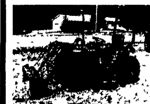
KUBOTA B1550 HSD 4WD, 17 HP w/Loader and Mid Mower - Nice