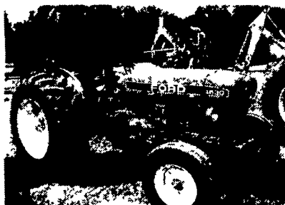
Ford 4630 Tractor 1993, 1050 Hours, Real Sharp

Woods 750 3 pt. Backhoe Woods RB700 7 ft. Blade Case 7 ft. Pull-Type Disc Miller 11 ft. Offset Disc Int. 11 Tooth Chisel Plow Int. 55 9-Tooth Chisel Plow Blanton 7-Tooth Chisel Plow MF 880 5 Btm. Plow Brillion 12' Packer JD 16x7 Grain Drill Brillion 5-Tooth Soil Saver Int. Stalk Shredder, 12' Wide, Does Not Windrow Woods C114 Rotary Mower Bush Hog RZ60 5 ft. Mower NH 328 Manure Spreader