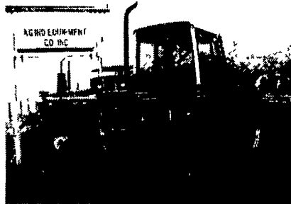
IH 1086 2WD, Cab, 4610 Hrs., 1979 Model

NH LX885 Skid Steer NH L553 Skid Steer (2) NH L785 Skid Steer NH L783 Skid Steer Bush Hog D1000 S.S. Mount Hoe