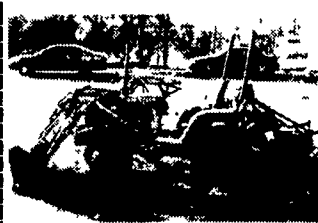
Kubota B5200 4WD 15 HP w/Loader, 4' Rear Finish Mower