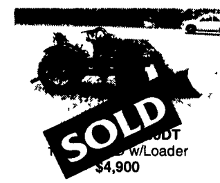
1998 w/Loader $4,900

Stop By Our Booth At The PA Farm Show Jan. 6 thru 11 See the New Line of Kubota Products