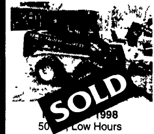
1998 50" Low Hours

Stop By Our Booth At The PA Farm Show Jan. 6 thru 11 See the New Line of Kubota Products