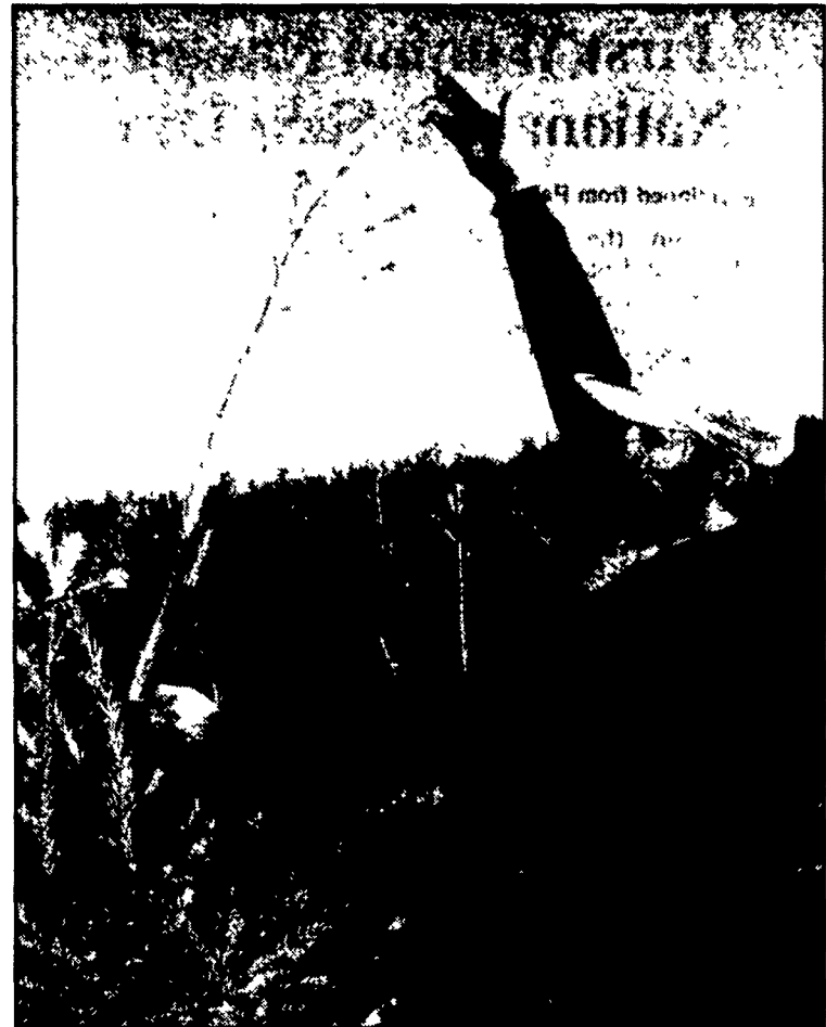
This year's growing season has promoted trees to grow up to three feet on the main stem.

See Lancaster Farming CowCam Visit our Website at www.lancasterfarming.com