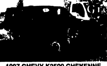
1997 CHEVY K2500 CHEYENNE w/Camper Top, V8, Auto, AC, 98,000 Miles

2150 S. Queen Street York, Pennsylvania 17402 Telephone: (717) 741-4681 1-800-723-7004