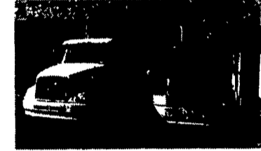
2001 VOLVO VNL 64T - 465 HP Day Cab, 99 Volvo VNM64T - 425 HP Day Cab