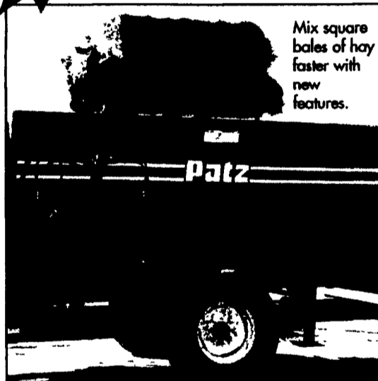
Mix square bales of hay faster with new features.