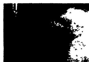
Stainless Steel Nipple Drinker