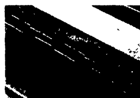
V-Link Feeding System