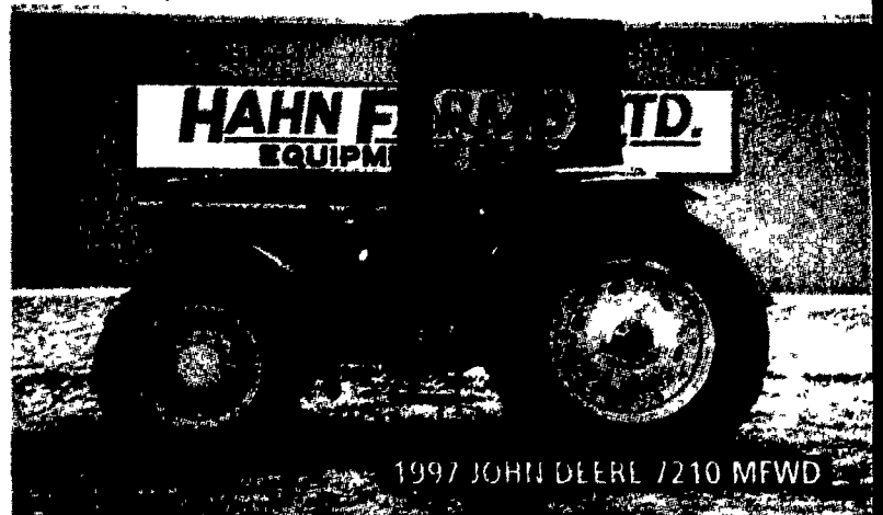
1997 JOHN DEERE 7210 MFWD