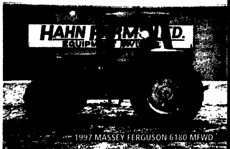
1997 MASSEY FERGUSON 6180 MFWD