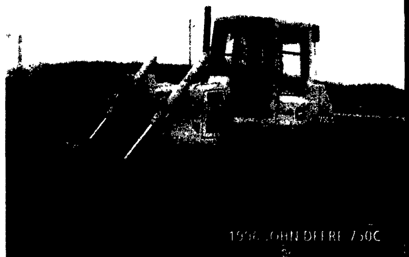
1996 JOHN DEERE 750C