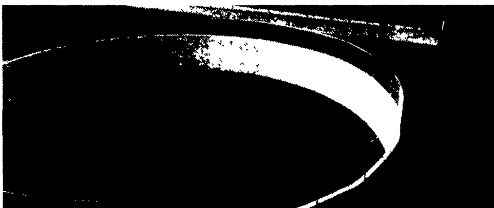
10' Deep Circular Manure Storage

Round or Rectangular, In-Ground or Above-Ground