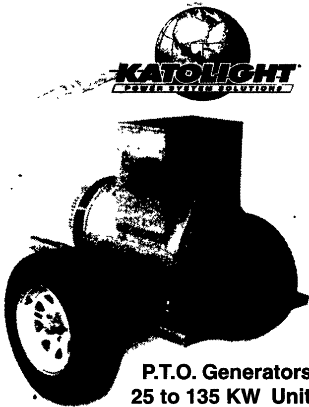
P.T.O. Generators 25 to 135 KW Units In Stock!

PENN POWER SYSTEMS Power Generation Systems Specialists