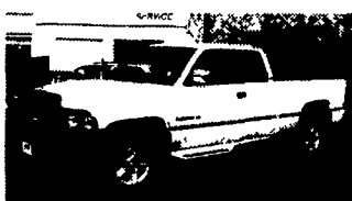
97 DODGE RAM 1500 CLUB CAB SLT V8, AT, A/C, 4x4, Most Options, 54,000 Miles, White

$2,800 Rebate Available On 2000 Leftovers