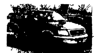
98 FORD F150 XLT V6, 5-Spd., 4x4, 35,000 Miles, Blue