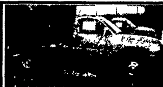
2000 DODGE RAM 3500 CAB & CHASSIS (1) 4x4 & (1) 4x2, 2 In Stock, Gas, Your Choice Of Body