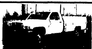
2000 DODGE 350 4x4 Stahl Grand Challenger Utility Body, AT, A/C

$2,800 Rebate Available On 2000 Leftovers