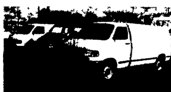
DODGE RAM VANS 1500's, 2500's & 3500's All Available With AT & A/C, Huge Savings, Up To $1,000 Rebates