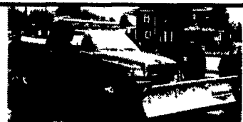
2000 DODGE RAM 3500 SLT CUSTOM BUILT V8, 4x4, Heil Dump, Diamond Heavy, Duty Plow