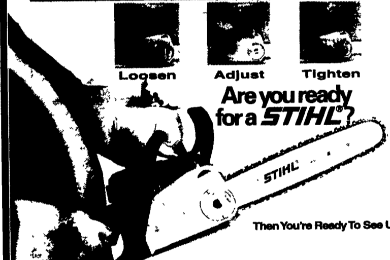
Then You're Ready To See Us!