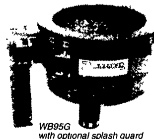
WB95G with optional splash guard