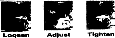
Loosen Adjust Tighten

Check out the new Quick Chain Adjuster for your 018C from STIHL.