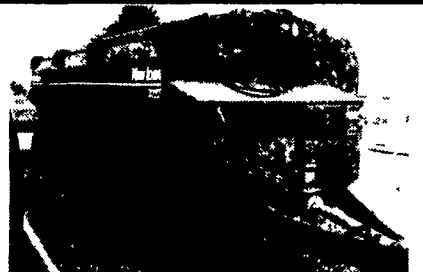
New Idea 3222 Side Kick Spreader with Hydraulic Lid..... $9,500 Needs a Home!