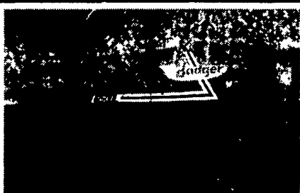
Badger 3300 Gal., 21.5 x 16.1 Tires, Excellent Condition..... CALL

1997 VAN DALE 2700 GAL. VACUUM TANK 16.5x16.1 Tires, Like New, Used Very Little $8,650