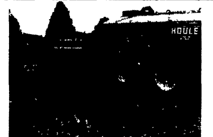
1999 Houle 8/12' Super Pump, Twin Nozzle on Trailer..... $6,850