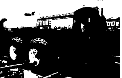
2000 Houle 3850 Gal., 23.1x26 Tires, Brakes & Lights, Rental.

Top Volume HOULE Dealer In North America