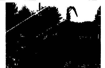
1993 Houle 32' Lagoon Pump, Good Condition..... $4,250