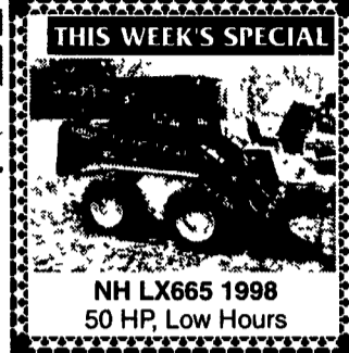
THIS WEEK'S SPECIAL NH LX665 1998 50 HP, Low Hours