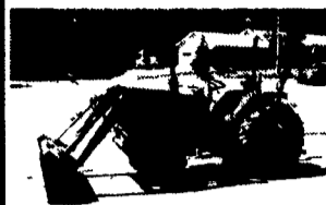
KUBOTA L2250DT 27 HP w/Loader, 1400 Hrs, Nice!