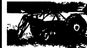
FORD 8N 2WD w/Loader, 3 Pt., PTO, Runs Great