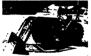
KUBOTA L2900 DT 32HP, 4WD, Loader, 1500 Hrs., Ag Tires

5' Brush Cutter 6' Sicklebar Mower Gandy Drop Spreader Bobcat 990 Backhoe Kubota 5' Boxscraper 3 pt. 54" Snowblower 6' Harley Power Rake