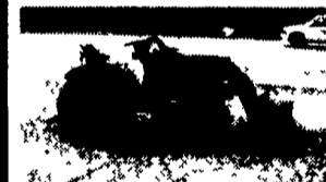
KUBOTA B7100DT 16 HP, 4WD w/Loader $4,900