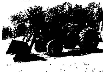
Case 485 Tractor/Loader