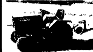
INGERSOLL 4016 16 HP, B&S Engine, 48" Mower, 1 Bottom Plow, Only 250 Hrs.

Call Us Today No Reasonable Offer Refused END OF SEASON USED EQUIPMENT DISCOUNTS!