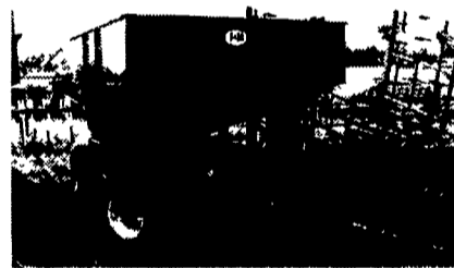
J&M Gravity Flow Box w/Gehl 606 Gear, Flotation Tires, Good Paint, Nice

Case 7 ft. Pull-Type Disc Miller 11 ft. Offset Disc Int. 11 Tooth Chisel Plow Int. 55 9-Tooth Chisel Plow JD 16x7 Grain Drill Brillion 5-Tooth Soil Saver NI 14A Manure Spreader NI 363 Manure Spreader w/Upper Beater & Gate Blanton 7-Tooth Chisel Plow MF 880 5 Btm. Plow Int. Stalk Shredder, 12' Wide, Does Not Windrow J&M Gravity Box w/Gear Woods C114 Rotary Mower Bush Hog RZ60 5 ft. Mower NH 328 Manure Spreader