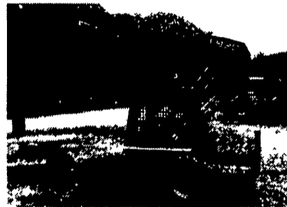
NH LX885 Skid Steer