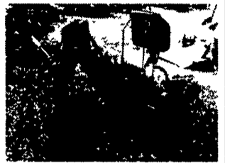
USED KUBOTA 4520 BACKHOE PTO Pump, 3 Pt. Mounts Available