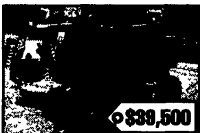
C 31520 1989 JD 9500 4WD, Conventional, Rock Trap, Grain Loss Monitor, Tires Drive - 30 5L x 32, Steering - 18 4 x 36 FS