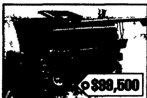
A 23062 1995 CIH 2188 2WD, 1913 Hours, Field Tracker, Specialty Rotor, Rock Trap, Grain Loss Monitor, Chopper, Tires Drive - 30 5 x 32, Steering - 14 9 x 24