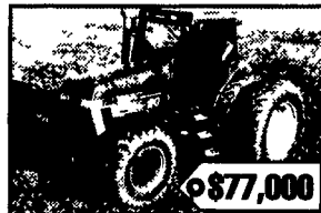
B 18836 1995 CIH 7250 MFD Cab, 1815 Hrs, 3Pt, Quick Hitch Tires Front - 16 9x30, Rear - 20 8x42, 1000 Pto, Pwr Shift, 215 HP