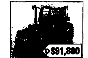
A 23784 1999 CIH MX200 MFD Cab, 550 Hours, 3 Hyd Valves, Tires Front - 14 9x30, Rear - 18 4x42, 540/1000 Pto, 165 HP