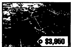
A 23172 Krause 1577 Rockflex Disc, 16' 8", Scrapers, Packer Hitch, Center Fold