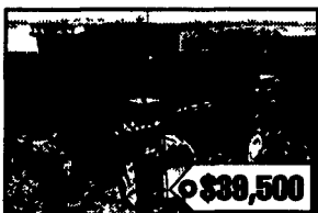
B 15933 1989 CIH 1640 2WD, 2387 Hours, Specialty Rotor, Chopper, Grain Loss Monitor, Rock Trap, Tires Drive - 28L x 26, Steering - 12 4 x 16