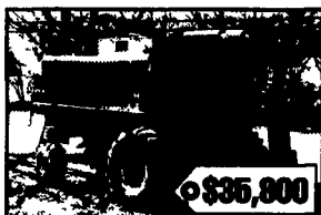
C 31143 1987 CIH 1660 2WD, 3666 Hours, Field Tracker, Standard Rotor, Rock Trap, Auto Header Control, Tires Drive - 30 5 x 32, Steer - 18 4 x 16