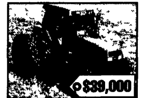
B 19890 1996 CIH 5230 MFD Cab, 1798 Hours, 3Pt, 540/1000 PTO Tires Front - 12 4 x 24, Rear - 18 4 x 34 Duals, 90 HP