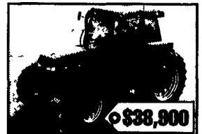
C 23186 1993 CIH 5250, 4500 Hours, Tires Front - 14 9x24, Rear - 18 4x38, 3 Pt Hitch, 3 Hyd Valves, 112 HP