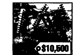
B 18976 IH 496 34' Folding Disc, 8" Front & Rear Spacing, Duals on Ctr & Wings, Farrow Firs, Pckr Hitch & Hoses