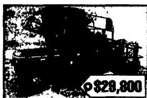
A 23497 1994 JD 6500 Hi-Cycle Sprayer, 1270 Hours, 420 Gallon Tank, Raven Sprayer Control, Foam Marker, 60' Hydraulic Folding Boom