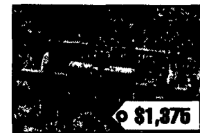
C 19130 Ferguson 10-12 Chisel Plow, SALE PRICE $1,375