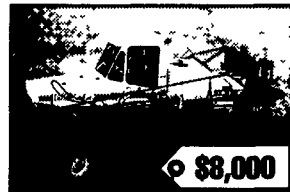
A 23500 Spray Coupe 220 Sprayer, 45' Booms, Markers, Cab with A/C