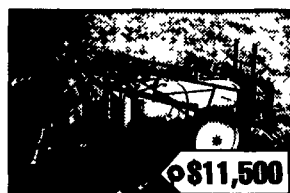
A 23549 1997 Hardi Navigator 550 Sprayer, 550 Gallon Tank, Eagle 45' Boom with 2 Sets of Nozzles