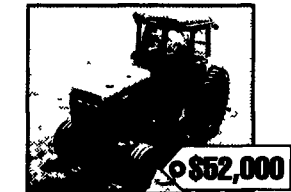
B 19587 1992 JD 4560, 2WD Cab, 1807 Hours, Diesel, Tires Front 14Lx16 1, Rear 18 4x46, 3Pt, 1000 Pto, 3 Hyd Valves, 156 HP