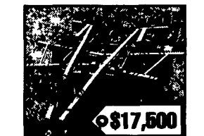
B 19636 DMI 530 Subsoiler w/ Disc Gangs on Front, Lead Shanks, Disc Levelers on Rear, Field Ready,