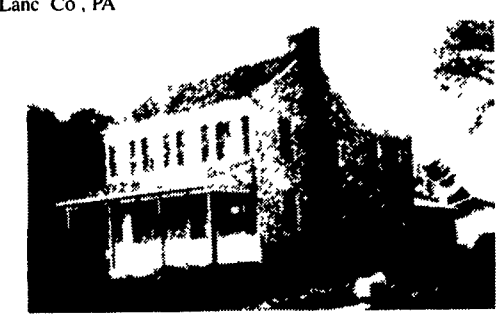
LOT 70' FRONTAGE, 160' DEEP M/L

Located at 24 Glenola Dr, Leola Turn off Rt 23 in Leola at Shell Gas Station on Glenola Dr to sale, Upper Leacock Twp.