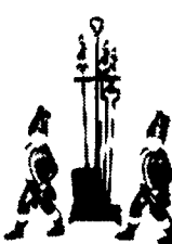
Fireplace Andirons & Tools