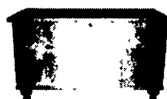
Pine Dovetailed Blanket Chest