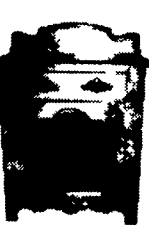
Victorian Wash Stand