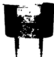
Martha Washington Sewing Cabinet