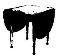
Cherry Dropleaf Table