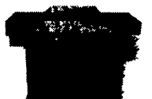
Early Dry Sink