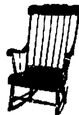
Early Hand Decorated Rocker