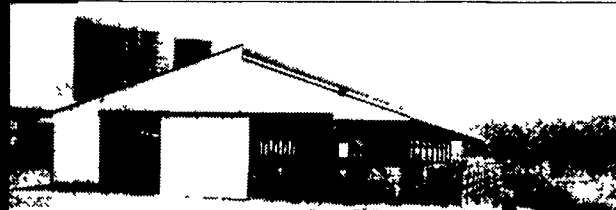
3 ROW FREESTALL BARN