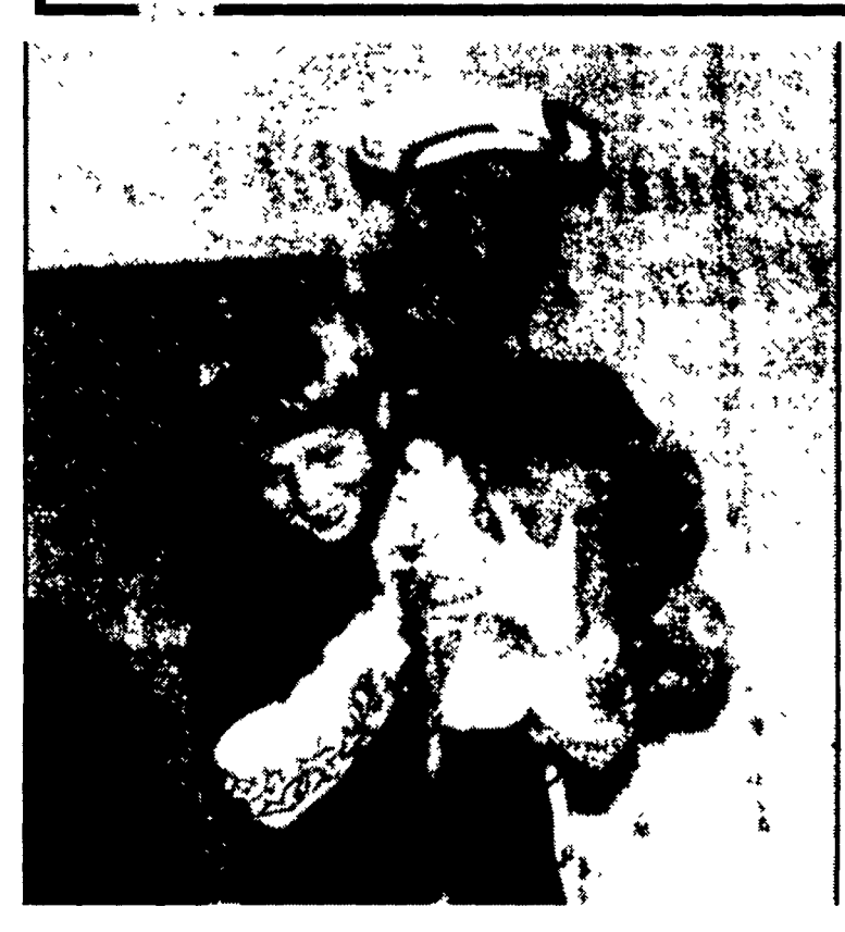
Students don't just watch, they participate in the play