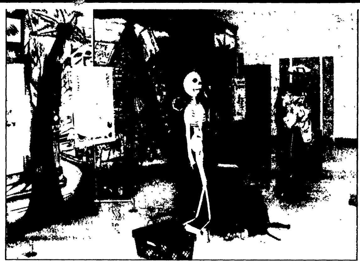
Does the mummy have something to do with the missing food?