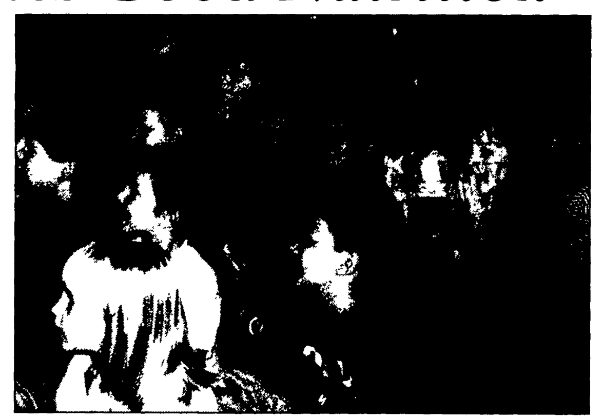
Students at Clay Elementary School watch "The Prince of the Pyramid."

Dairy Council Middle Atlantic funded by local dairy farmers provided the program to promote health and awareness through nutrition education. In Lancaster County alone, more that 10,000 students saw the performance