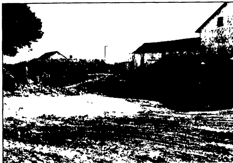
The 125-year-old farmhouse stood here before moving almost 400 yards to a lot on an adjacent development.