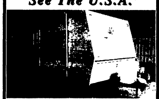
1999 Wilderness 28' Travel Trailer, Fully Furnished, Rear End Damage $7,900 - or best offer