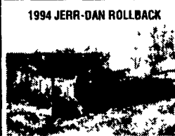
1994 JERR-DAN ROLLBACK 28 Ft Main Bed w/2 Winches Tow Bar 13 Ft Overhead Tilt w/Winch Mounted on Single Axle Truck Frame, Easy Splice Job $7,500