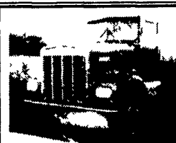
1980 KENWORTH W900-A 6-V92 Eaton 9 Spd w/PTO 3 70 Rockwells AC Air Dryer New Batteries Alternator, Bumper Grill Shell Steering Tires Runs Well Ready For Inspection $7,500 OBO