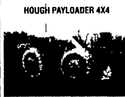
HOUGH PAYLOADER 4X4 6 Cyl Hercules Gas Engine 1300x24 Tires 1-1/2 Yrd Bucket Strong Running Machine with Work Brakes and Fork Attachment $9,500