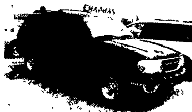
2000 FORD EXPLORER XLT 4x4, One Owner

Credit Problems? Call 1-888-CARS-4-YOU TRUCKS - UTILITY VEHICLES - TRUCKS