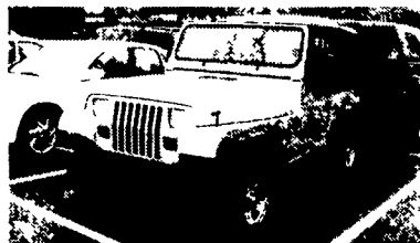
95 JEEP 4x4 AT, A/C, Low Miles, #P4541

LEBANON 20th & Cumberland Sts. Rt 422 West Daily, 9-5 Sat