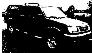
2000 NISSAN FRONTIER CREW CAB 4x4, V6, Auto, Loaded, Off Road Pkg., #P4537