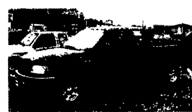
97 FORD F150 SUPER CAB Lariat, 5.4L V8, AT, A/C, 2WD, Most Options, 25,000 Miles, Black, #P4474 $20,998