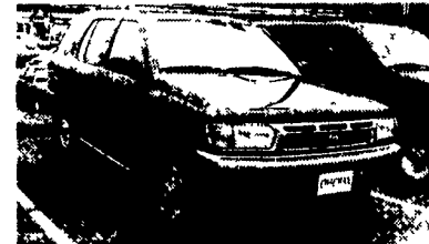
97 NISSAN PATHFINDER LE Leather, Moon Roof, Auto, Air, CD #P4538