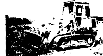
Cat 943 Crawler Loader, EROPS Good UC, Recent Eng Rebuild $37,500