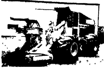
Hydro Ax 611, Detroit Dsl w/22" Shear Head, Excellent Condition $18,500