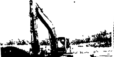
93 Hitachi EX200-2 w/Aux Hyd ... $36,000