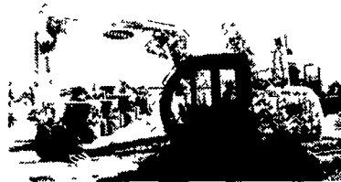
96 Samsung SE 130 LC-2, 2900 Hrs, Plumbed for Hammer $29,500

89 JD 455G Crawler Loader, 2050 Hrs, 80% U/C $26,500 89 JD 644G Rubber Tire Loader, 8000 Hrs $42,000 98 JCB Robot 165 Skid Steer Loader, 100 Hrs $12,900 79 Cat 955L 13X, 70% UC $26,000 79 JD 755, Rebuilt Hydros $21,000 87 Komatsu PC200 excavator, Bucket & Grapple $19,500 GMC Lube Truck, 7 tanks & reels w/air compressor $13,500 Hitachi EX60, 14,000 Lbs $13,500 CAT 955K Crawler Loader, Fair Condition $9,500 MF 6500 Lb. Forklift w/Side Shift $6,900 Concrete Crusher For 50,000 Lbs Excavator $4,500 Coleman Light Tower, Kubota Dsl $116.84/Mo. or $3,500 Stone SR2500 Tandem Vibratory Roller $2,500