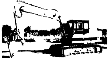
Cat E120B & 110B Excavators, 6 To Choose From $22,500 to $24,500