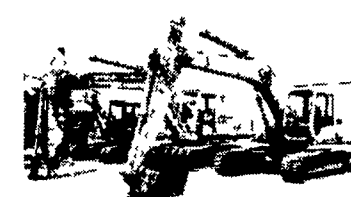
95 Hitachi EX200-3-LC, AC Good Condition $46,000 92 Hitachi EX200-2, Plumbed 42 Bucket $34,000