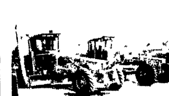
JD 670 Graders, 12' Blade 1 w/Snow Wing $19,000 & $25,000

91 Bobcat 943 Skid Loader, Grapple Bucket, Tracks Foam Filled Tires $11,500 96 ICC DL7000 Track Skid Loader, Cummins DSL Low Hrs $13,000 Case 580C Backhoe, Cab Ext Hoe $10,500 (2) Cat 977L Crawler Loaders, EROPS $16,000 & $19,000 JD 710B Backhoe, OROPS, Plumbed for Hammer $13,000 Ford L8000 Single Axle Dump Truck, Cat Dsl $6,500 JD 450G Dozer, 6 Way Blade $26,000 Stone Wolfpack 2500 double drum asphalt roller $3,500 86 JD 450E Dozer, 6-Way Good UC, ROPS $20,000 Case 450C Dozer, 6-Way, New UC $18,500 Marklift 30' Man Lift, 4x4, Good Cond $9,800