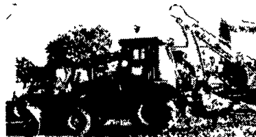
96 Case 580, Super L 4x4, Ext Hoe, 2400 Hrs, Service Records $33,500 89 Case 580K 4x4, Ext. Hoe, 4300 Hrs $19,500