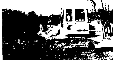
95 Liebherr 621C, 5900 Hrs, Excel. U/C $42,000

RD#1, Box 418, Milton, Pa. 17847 Phone: 570-523-9598