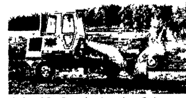
88 Cat 953 Crawler Loader, Cab, 4-in-1 Bucket, Nice $42,000 87 Cat 953, Cab, 4-in-1 Bucket 90% U/C $34,000