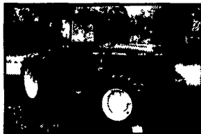
A 22559 1983 JD 4650 MFD Cab, 5800 Hrs, Tires: Front - 18 4x26, Rear - 20 8x38, 540/1000 Pto, 165 HP