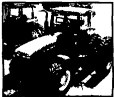
B 19590 1996 JD 8400 MFD Cab, 2386 Hrs, Tires Front 16 9x30, Rear 18 4x46 Duals, 1000 Pto, 3PT, Power Shift, 3 Hyd Valves, 225 HP