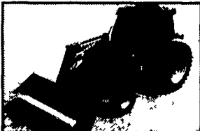
A 23187 1991 CIH 5140 2WD Cab w/ L510 Loader, 4013 Hours, Tires: Front - 11 0x16, Rear - 18.4x38, 540/1000, Pto, 3 Pt, 94 HP