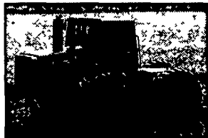
C 31481 1980 Massey Ferguson 4840 MFD Cab, 5000 Hours, Tires Front - 30 5 x 32, Rear - 30 5 x 32, 3 Pt, New Clutch, 210HP