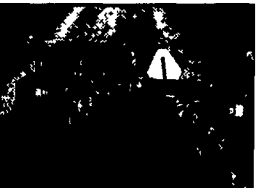
A 18868 DMI 500 3 Shank Subsoiler, MRD Shanks with Coulters, Auto-Reset, SALE PRICE $4,900