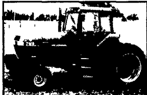
C 19501 1991 CIH 7110 2WD Cab, 2531 Hours, Tires Front - 11 0x16, Rear - 18 4x38, 540/1000 Pto, 131 HP