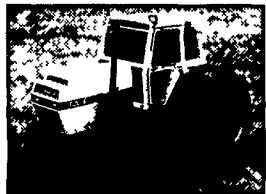
A 23046 1979 Case 2590 2WD Cab, 6636 Hours, Tires Front - 18.4x16a, Rear - 20.8x38, Diesel, 4x3 Power Shift, 2 Hyd Valves, 1000 Pto, 180 HP