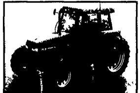
C 23186 1993 CIH 5250, 4500 Hours, Tires Front - 14 9x24, Rear - 18 4x38, 3 Pt Hitch, 3 Hyd Valves, 112 HP