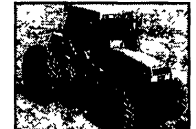
B 19890 1996 CIH 5230 MFD Cab, 1775 Hours, 18.4 x 34 Duals, 90 HP