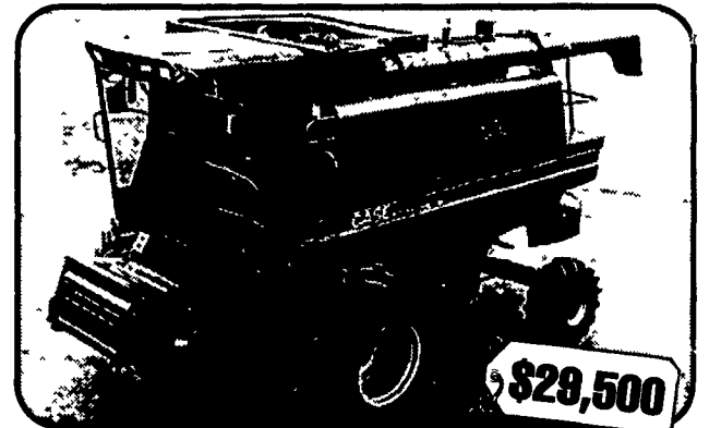
A 21511 1987 CIH 1680 2WD, 5300 Hours, Std Rotor, GLM, Auto Hdr Control, Tires: Drive - 30.5 x 32, Steer - 18.4 x 16.1

This feature will enhance visibility when exiting the cab after dark. This light will stay lit for 30 seconds allowing the operator to exit down the ladder safely.