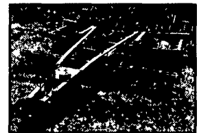
B 22866 DMI 730 7 Shank Eco-Tiger Chisel Plow w/Lead Shanks, Disc Attachment, Rear Leveler SALE PRICE $12,900