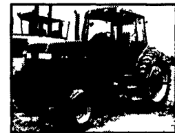
B 19583 1991 CIH 7120 2WD Cab, 2169 Hours, Tires Rear - 18 4x46, Diesel, 540/1000 Pto, 3 Pt, Pwr Shift, Quick Hitch, 3 Hyd Valves, 151 HP