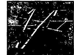
B 19636 DMI 530 Subsoiler w/ Disc Gangs on Front, Lead Shanks, Disc Levelers on Rear, Field Ready, SALE PRICE $17,500