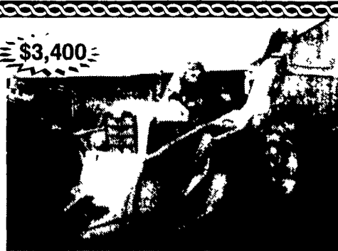
Ford 901 Tractor, gas eng, STD Trans w/Ford picker. Good working unit. 570-437-2212 • 570-437-3848