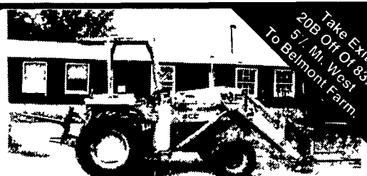
MF 50C Loader Tractor, ROPS, 3 pt. 1700 Hrs. No PTO, Clean $8,500