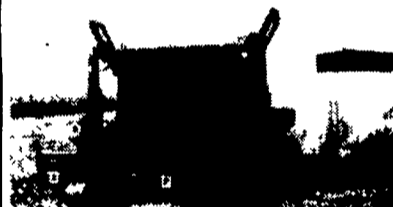
Square Bale Tub