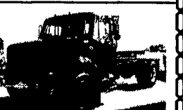
1993 International, 7.3 Diesel 5 Speed Trans PS AC Full Disc Brakes 79,000 Miles New Rubber Paint All The Bells Looks New Runs New 25 500 GVW