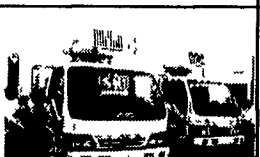
(2) 1995 GMC W4, 4 Cyl Turbo Diesel 12 Supreme Reeler Auto PS PB 14,250 GVW