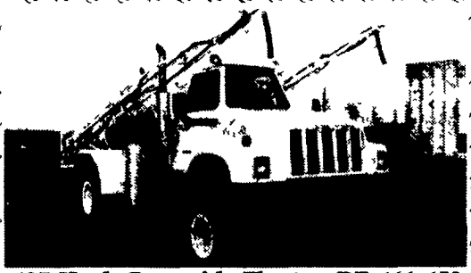
'95 Hack Centeride Floater: DT 466, 653 Allison, 1800 gal., 65' booms, Durco, Ravens 460, SS foam/rise/educator, Goodyear XT's, 85%, Excellent Condition 717/375-2229 PA

'91 Jeep Cherokee 4 DR, 4x4, 4.0 6 cyl. auto, PS, PB, air, AM-FM cass., new radials, 71,000 miles, forest green, $5,975. 717-733-2873