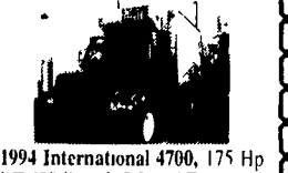
1994 International 4700, 175 Hp DT 408 Diesel 5 Speed Trans Full Disc Brakes Budd Wheels 22.5 Rubber PS AC 25 500# GVW 14 Supreme Reeler Body Folding Rear Dis Thermo King MD11 Unit Clean Truck!