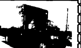
1995 Ford E350, 460 HP Gas H/D Auto 14 Ft Body Roll Up Rear Dr Nice Shape 10,900 GVW