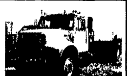
1994 International, Cab & Chassis DT 466 210 HP Eng 6 Speed Trans AC PS Full Air Brakes Looks New & Runs New! 33,000 GVW