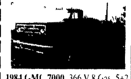
1984 GMC 7000, 366 V.8 Gas 5+2 spd Trans Hyd Brakes New Paint Color Red 28,000 GVW 108 184 Original Miles New Tuneup New Service New Tires New Brakes PA Stat Insp