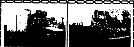
1996 Freightliner LF70, 18' Kidron Reeler, 5.9L Cummins, 6 Speed AC PS 26,000 GVW

Curry Supply Co., Curryville, PA 1-800-345-2829