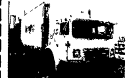
1984 International, Cargo Star w/16 Dry Van Body Roll Up Rear Door 7.3 Diesel Auto Hvd Brakes 20 Rubber 22 5000 GVW 192,000 Miles

Best mechanical trucks in the area, plus the cleanest! We service what we sell We offer a wide variety of dry van bodies, storage bodies and flatbeds We also shorten & lengthen chassis to accommodate your truck body or flatbed