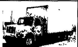
1994 International 4900, DT 466 5 Speed Trans AC PS Full Hyd Disc Brakes 11R22.5 Tires 25 500 GVW 24 Body Side Dr Litt Gate Roll Up Rear Dr