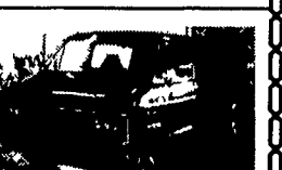
1992 Dodge Ram 150, V6 Mag Eng Auto New Brakes Tires & Shocks 75,616 Miles Excellent Like New!

Phone 717-664-1696 CHARTER ENTERPRISES, LTD. 270 Hostetter Road, Manheim, PA