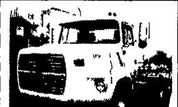
1994 Ford L9000 Tractor, GVW 34,700 Single Axle Engine N14 Cummins w/310 HP Transmission 10 Spd Manual Air Suspension Air Brakes P/S & AC