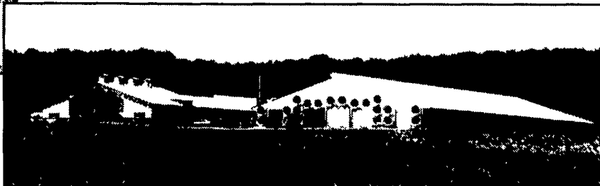
Free Stall Milking Center

- Dairy Facilities - Large or Small, Contact King Construction For Design and Construction