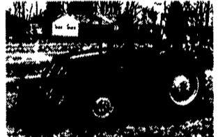
JD 1070 4WD Tractor/Loader, 39 HP, Nice Shape!