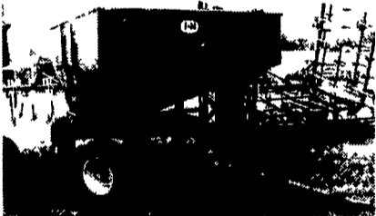
J&M Gravity Flow Box w/Gehl 606 Gear, Flotation Tires, Good Paint, Nice