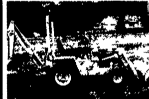
TERRAMITE T5C 20HP, Gas Tractor, Loader Backhoe