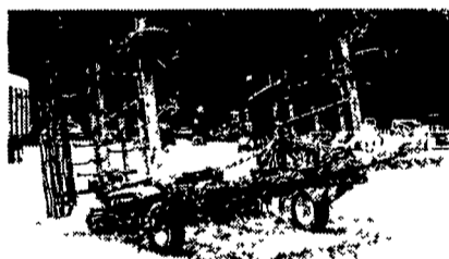
KMC 21' Field Cultivator w/Rolling Basket, Guage Wheels On Wings