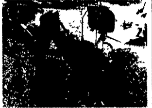
USED KUBOTA 4520 BACKHOE PTO Pump, 3 Pt. Mounts Available