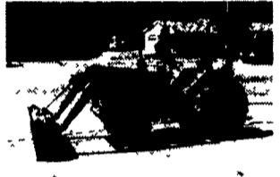
KUBOTA L2250DT 27 HP w/Loader, 1400 Hrs., Nice!