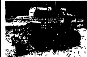
KUBOTA B1550 HSD 4WD, 17 HP w/Loader and Mid Mower - Nice