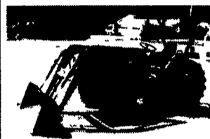
KUBOTA L2900 DT 32HP, 4WD, Loader, 1500 Hrs., Ag Tires