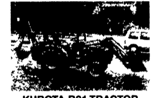
KUBOTA B21 TRACTOR w/Loader & Backhoe Nice Shape, Low Hours, 4x4, Power Steering, R4 Tires