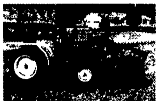
FORD 1715 4WD w/Loader, 27 HP, 300 Hrs. Spotless!