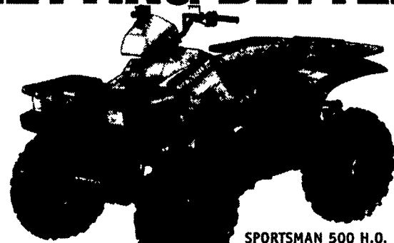
SPORTSMAN 500 H.O.