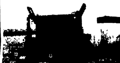
Square Bale Tuber