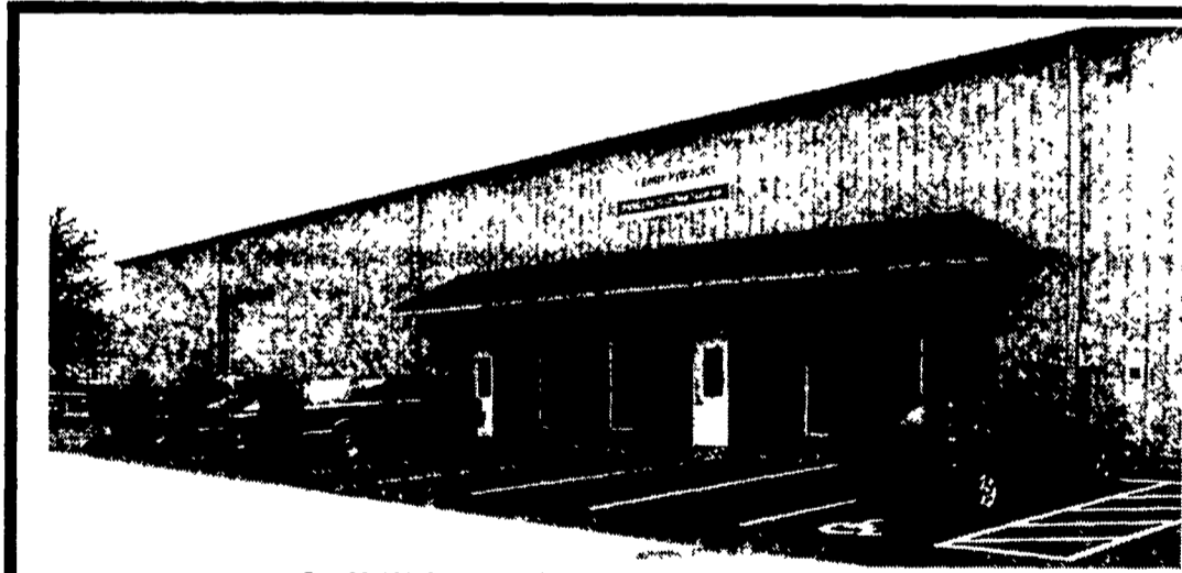
Our 20,000 Sq. Ft. Facility Enables Us To Serve You Better