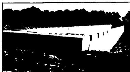
300' Long Manure Pit For Hog Confinement