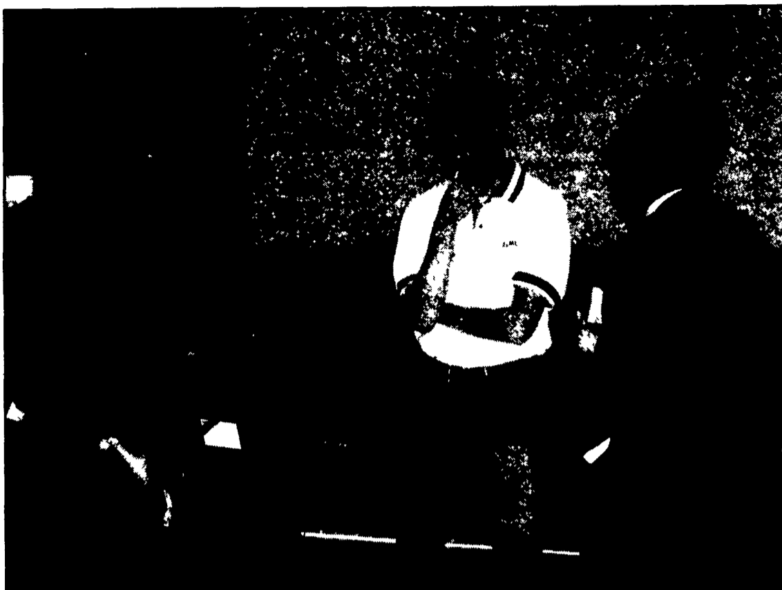
Andy Rogowski with Daylay Egg Farm, West Mansfield, Ohio, center with white shirt, spoke at the symposium Monday. Daylay has about three million birds, including 2.6 million layers and 610 pullets on four farms. The farm direct-markets composted poultry manure as a soil additive.