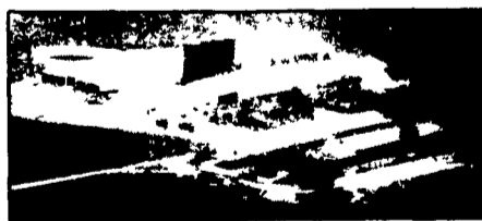
Far Left: 1-Million Gallon Circular Manure Storage Tank Far Right: 2 Silage Pits In-Barn Manure Receiving Pit

17 Years Experience In Pouring Concrete Manure Pits!